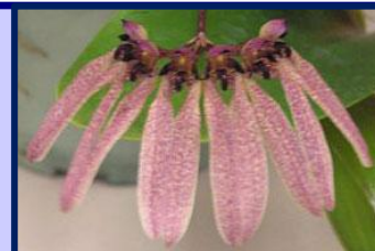
Photo: Bulbophyllum baucoense , March's Advanced Winner